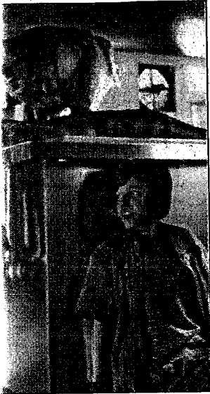
AMBLIN ENTERTAINMENT/UNIVERSAL PICTURES

of dinosaurs amok will be shown Green in downtown Herndon.